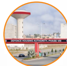
Defence Housing Authority