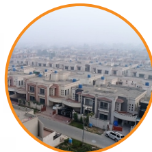
Paragon Housing Society